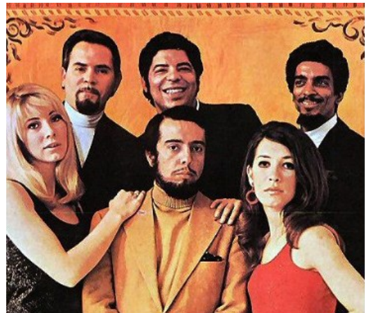
(Article adapted from Wikipedia)

Editor: The "Abba" similarity is notable. I know which group I preferred.