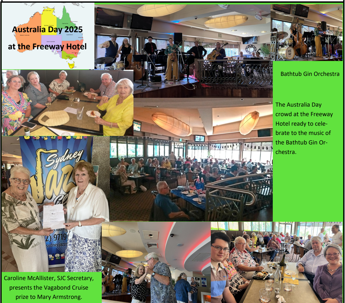
Bathtub Gin Orchestra